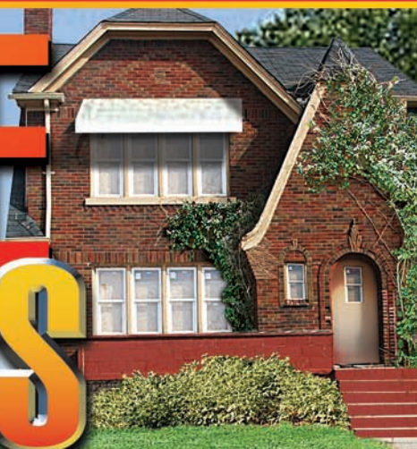
Photo of house is a likeness of the Grand Prize and not an actual depiction.